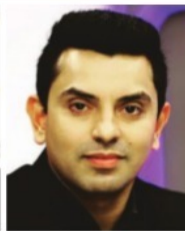
Tehseen Poonawalla Political Trendwatcher