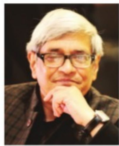
Keynote Bibek Debroy Chairman, EAC to the Prime Minister